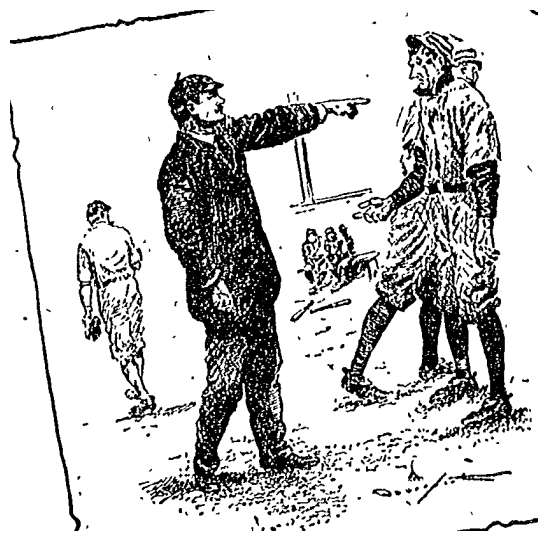
DAVENPORT'S CARTOON OF "SPALDING AS UMPIRE," 1897.